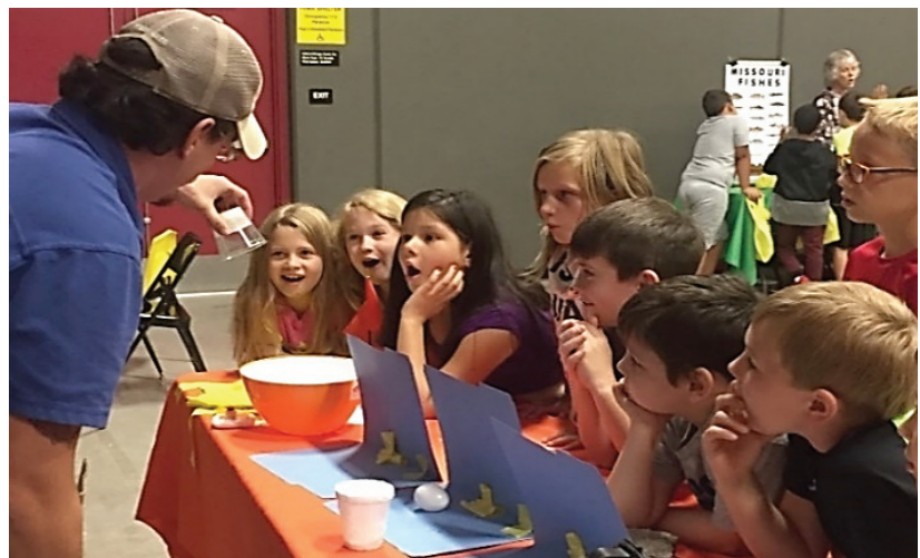
Pictured above: Elementary age participants at a VOICE Experience

I believe that it increases career awareness and gives school the opportunity to bring something new to the table. A lot of the smaller schools do not have the ability to go to large cities as often, so being able to bring technology they have never seen really enriches the kids minds.